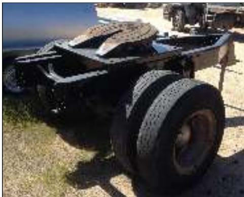
FARM SINGLE AXLE DOLLY PRICE : $2,750